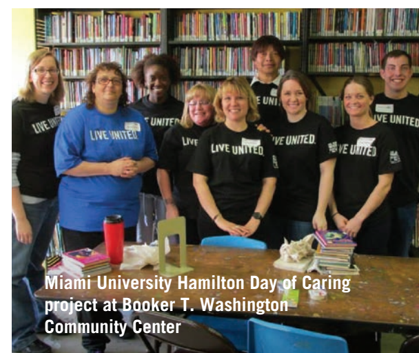
Miami University Hamilton Day of Caring project at Booker T. Washington Community Center