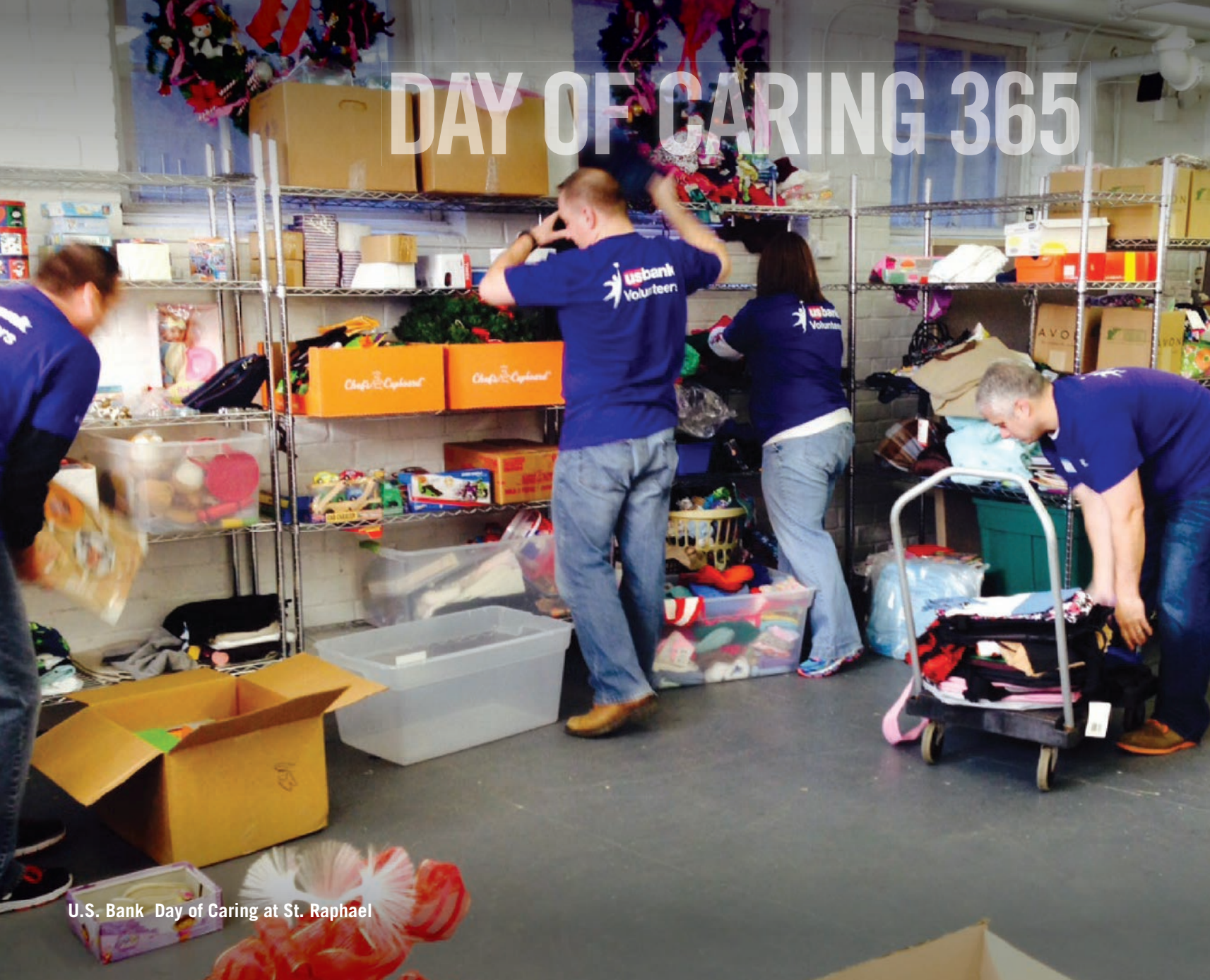
U.S. Bank Day of Caring at St. Raphael