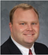
Peter Abner Kirsch CPA Group, LLC