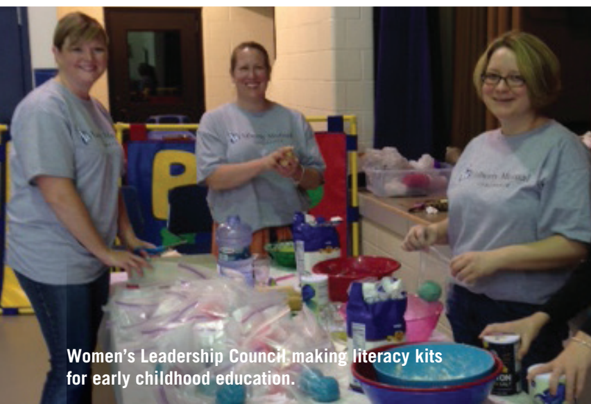
Women's Leadership Council making literacy kits for early childhood education.