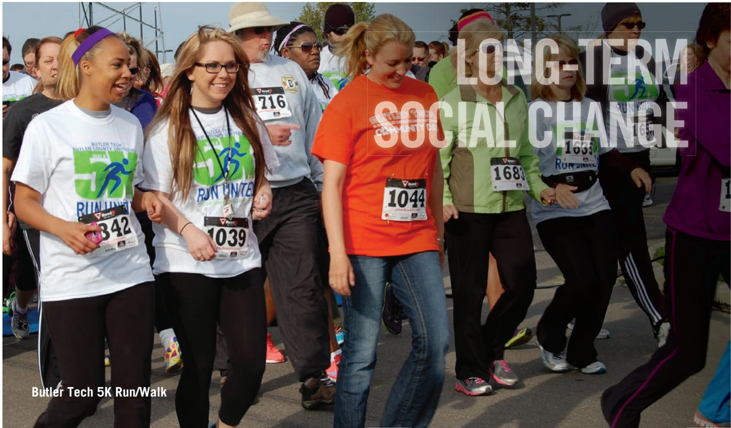
Butler Tech 5K Run/Walk