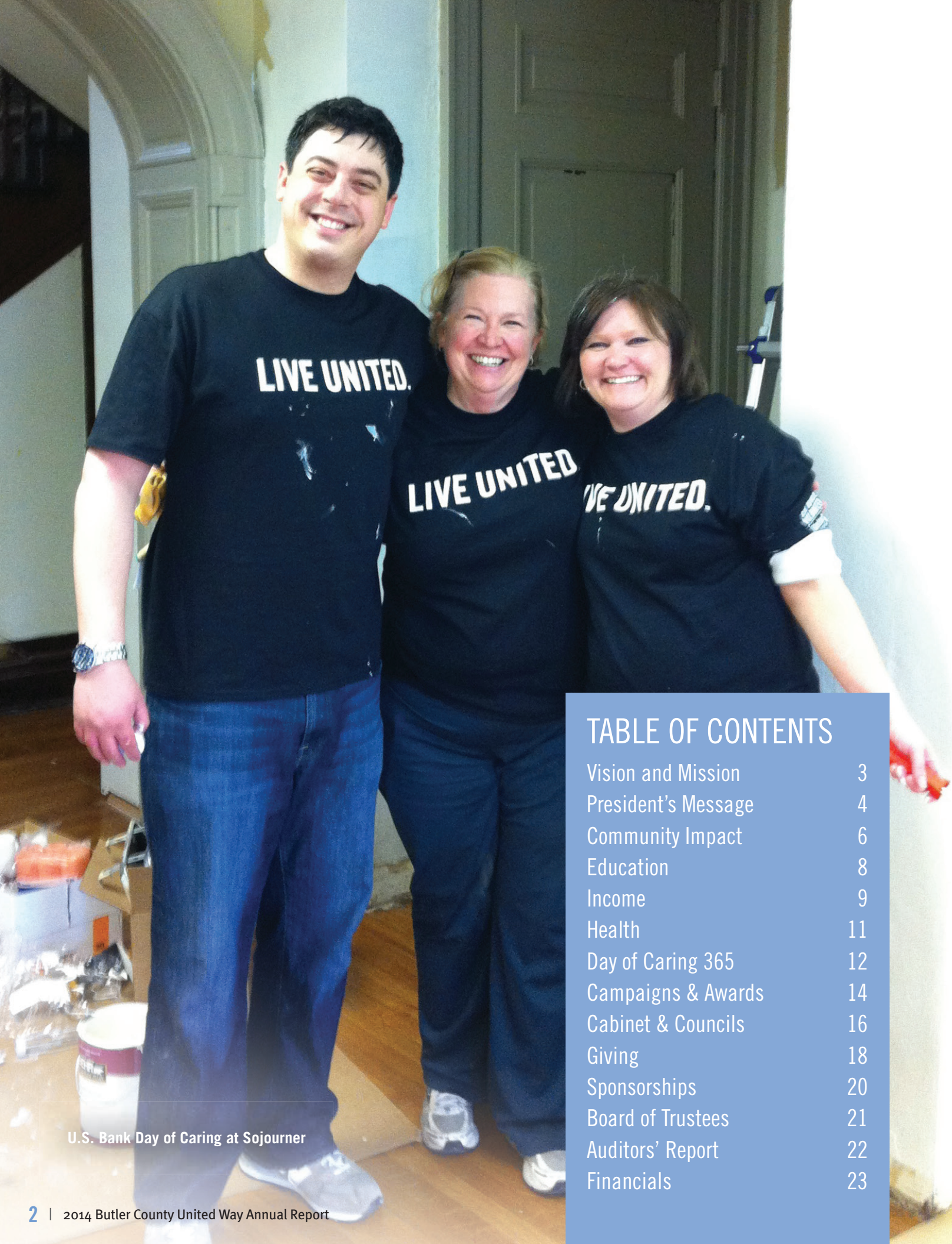
U.S. Bank Day of Caring at Sojourner