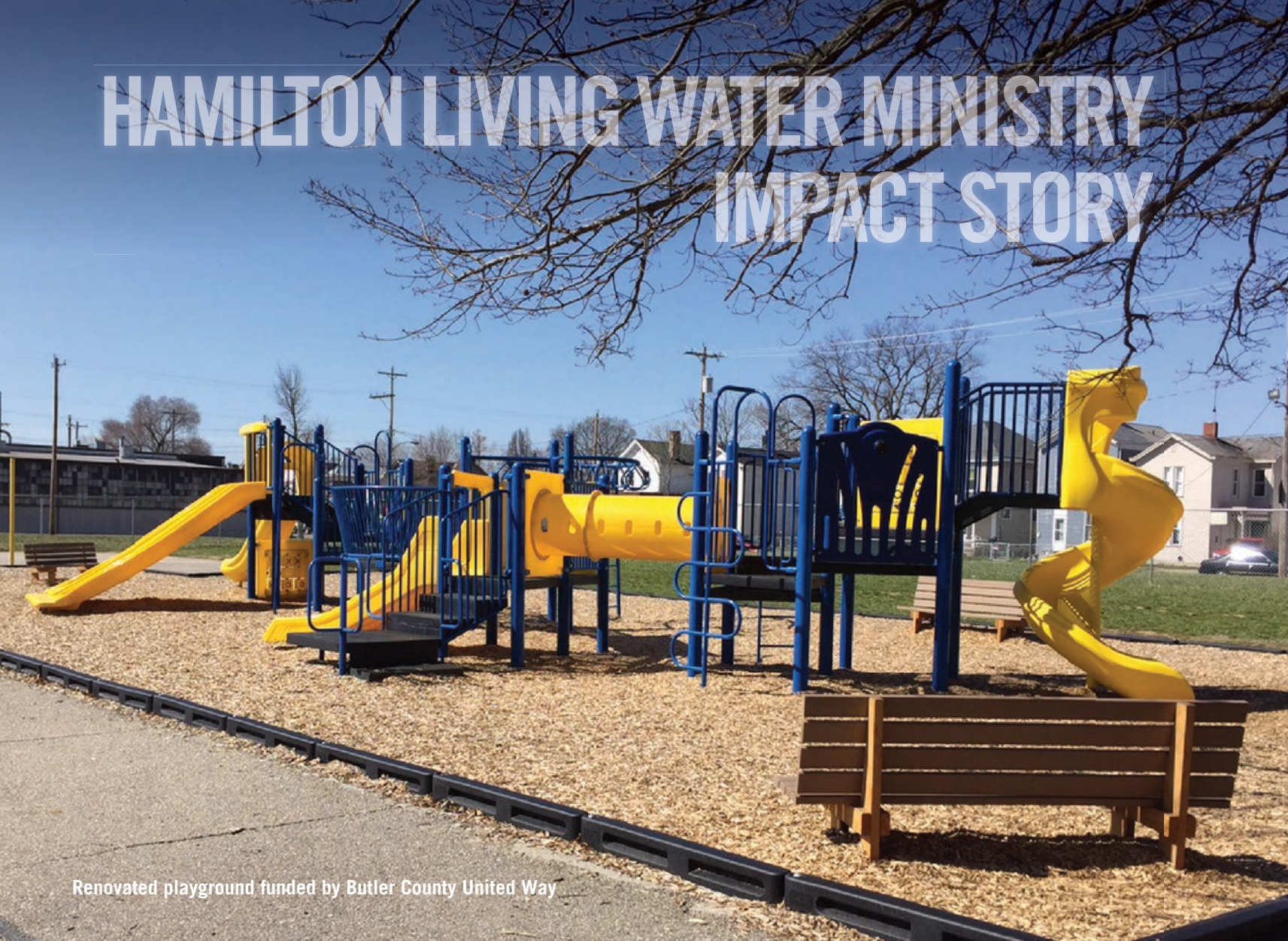
Renovated playground funded by Butler County United Way

HAMILTON LIVING WATER MINISTRY (HLWM) IS A GRASSROOTS, NONPROFIT AGENCY FOUNDED IN 1999. THIS AGENCY SERVES AT-RISK CHILDREN IN GRADES K-12 THROUGH AFTERSCHOOL AND SUMMER PROGRAMS TO PROMOTE ACADEMIC ACHIEVEMENT, ENRICHMENT OPPORTUNITIES AND MENTORING. IT ALSO SERVES FAMILIES AND ADULTS THROUGH THEIR NEIGHBORHOOD SERVICE CENTER FOR NEEDS SUCH AS REFERRAL SERVICES, TRANSLATION, COMMUNITY AWARENESS AND OTHER OUTREACH EVENTS.