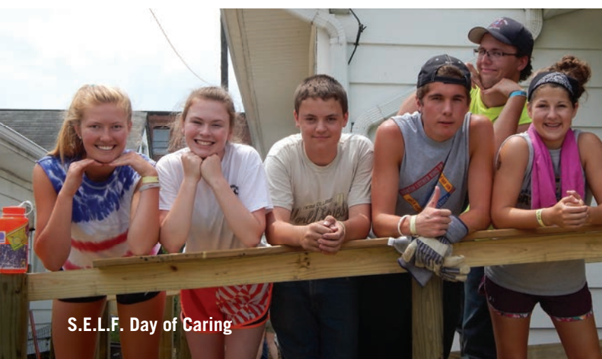
S.E.L.F. Day of Caring

Barnes Aerospace Deloitte Consulting, LLP First Financial Bank Great Miami Valley YMCA Liberty Mutual Insurance Linkinnati U.S. Bank Women's Leadership Council