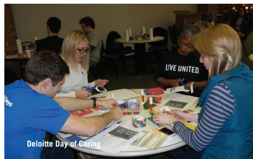
Deloitte Day of Caring